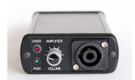
Portable Ultrasonic Power Amplifier (Model B)